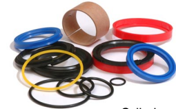
Cylinder seal kit